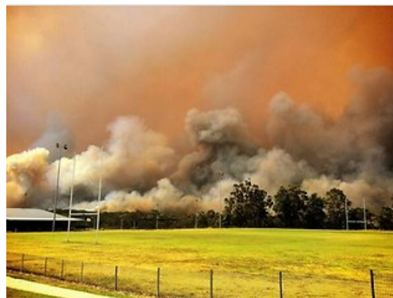
Dan Weatherhead posted this view of the Springwood fire looking toward Winmalee from Warrimoo Oval.

There are also unconfirmed reports of properties being lost at North Doyalson, on the Central Coast; at Lithgow; at Yanderra and Balmoral, in the Southern Highlands; and in Port Stephens, where a fire is burning near Newcastle Airport which has been closed.